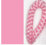
ROSA PASTEL Pant. 1905C 281