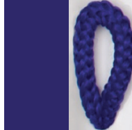
LAPIZLAZULI Pant. 2745C 62