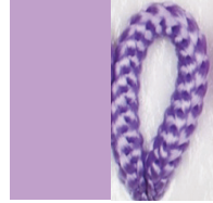
MALVA Pant. 2567C 141