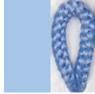
CANET Pant. 2717C 43